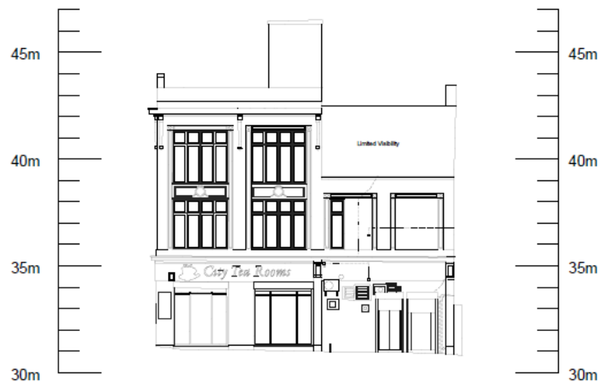
SIDE LANE ELEVATION