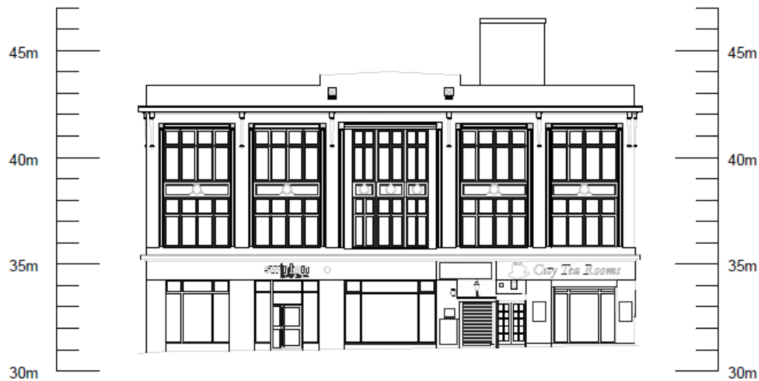
ST THOMAS STREET ELEVATION