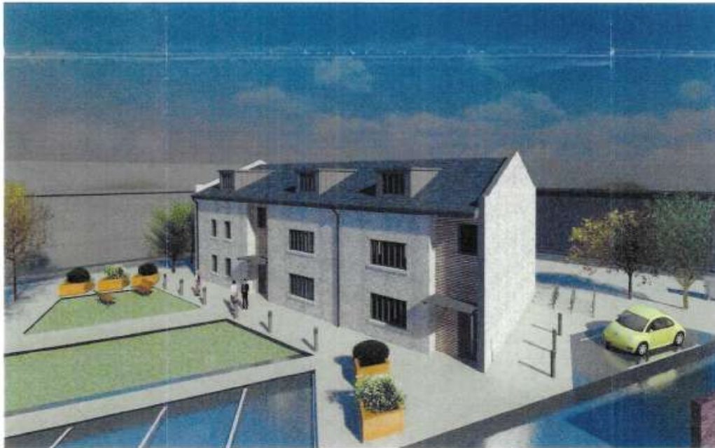
South View 2